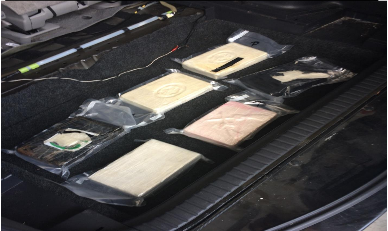
Six kilograms of cocaine seized in a hidden compartment in a vehicle